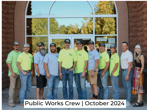
Public Works Crew | October 2024