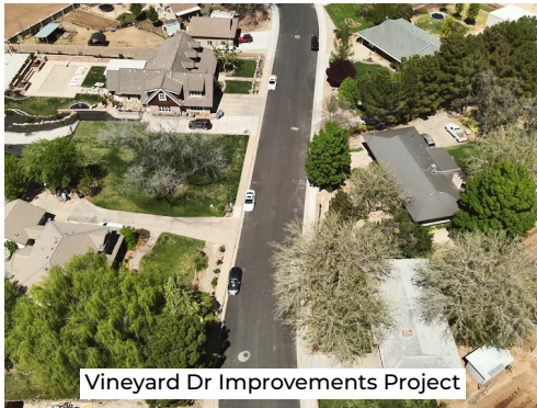
Vineyard Dr Improvements Project