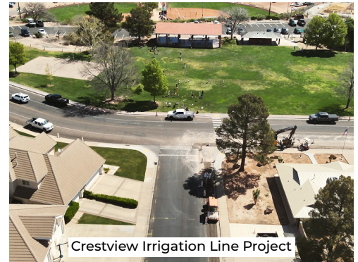
Crestview Irrigation Line Project

We do have some amazing events coming up. On December 6th, we will celebrate Samichlaus "Swiss Santa Night", and the lighting of the tree across from city hall. This is a great event for the entire family and friends. On December 14th, we will celebrate Wreaths Across America. This will take place at the Santa Clara Cemetery. If you have not experienced this event, I would highly recommend it for everyone. It's a great time to be reminded of the great sacrifice our military members have made to allow each of us the freedom we enjoy. We have so many of our own who have served and sacrificed so much.